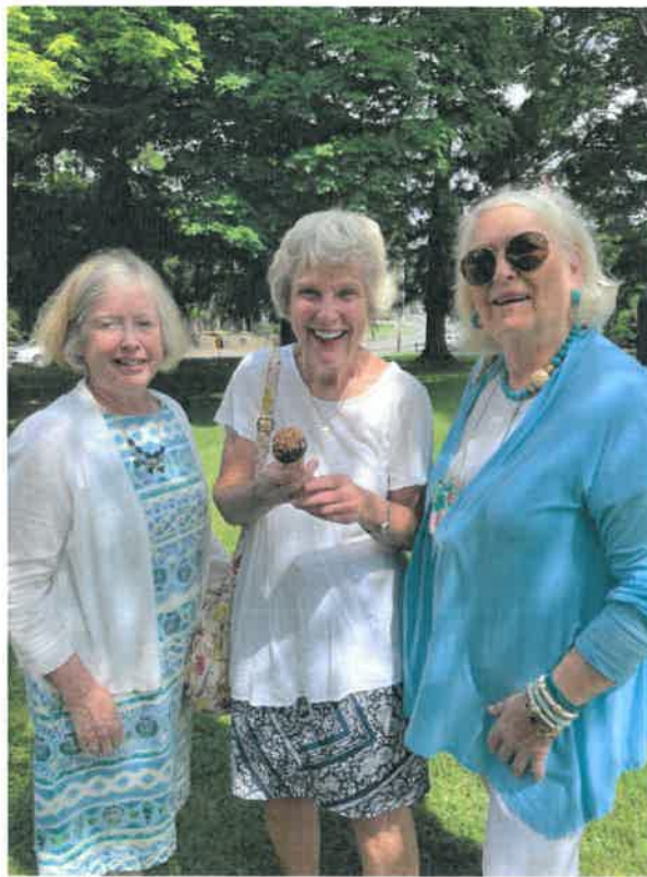
Ice Cream Socials June – July – August 2020