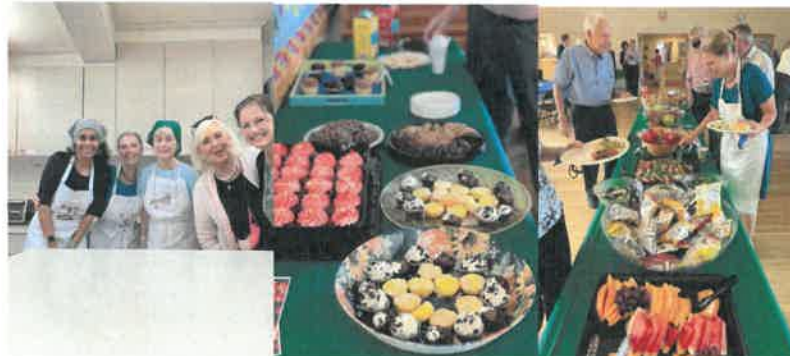
Welcome Back Sunday 9/12/20