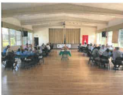
Welcome Back Sunday 9/12/20